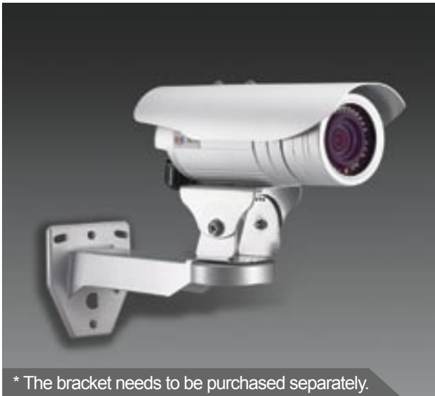
* The bracket needs to be purchased separately.