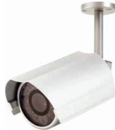
Compact Size with Vari-Focal Lens